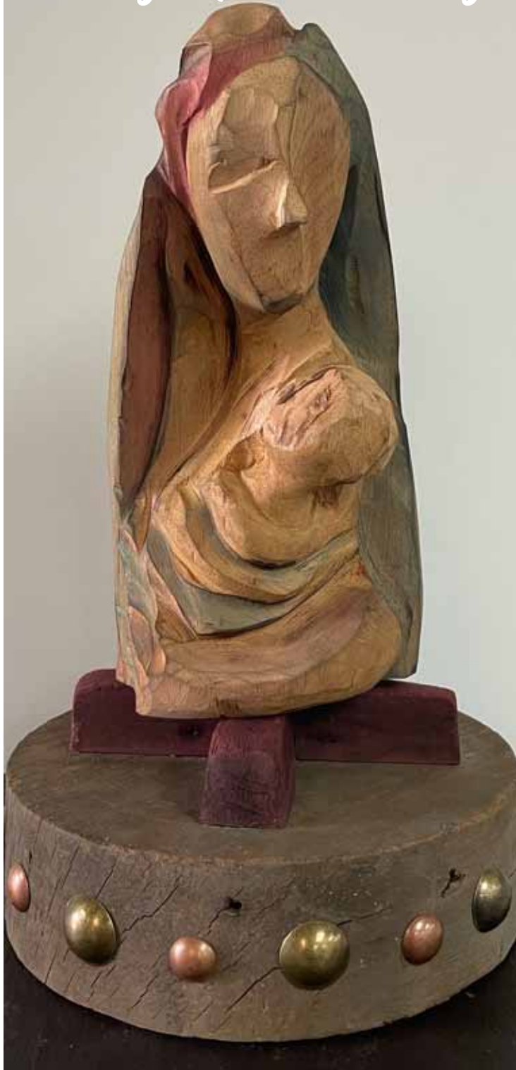
Mother of Spring by Dusty Reed