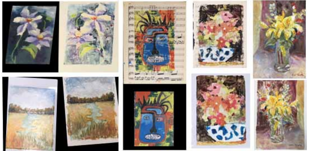
A few original plus print images from Bonnie's Oil Monotypes Mini Workshop, Feb. 1st