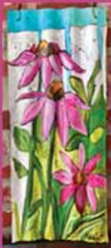
Margo Baker, Plasma Cut Metal & Collage Art