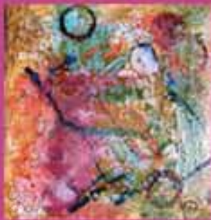
Bonnie Camos & Louise Guidry Encaustics

It's a showcase arts market of ten of the LAA's very talented workshop instructors! The perfect time to learn new skills as they demonstrate their art or craft. Shop, visit with the artists, watch demos and buy local art...all in one spot! Sign up for future workshops or just request more info. Buy a raffle ticket or two! You could be the lucky winner of a $50 Gift Certificate to be used towards the purchase of a future workshop!