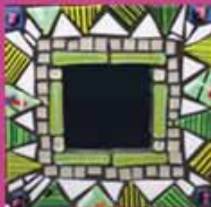
Ginger Kelly, Glass & Mosaics