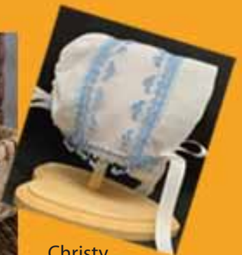
Christy Castille, Tattting