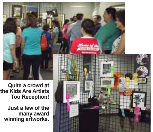
Quite a crowd at the Kids Are Artists Too Reception!