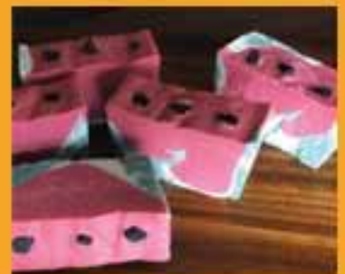
Nealy Atkins: Soaps, oils and balms