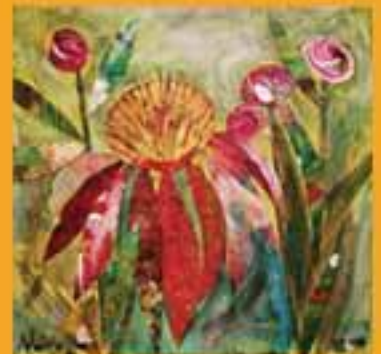
Margo Baker, Plasma Cut Metal & Collage Art