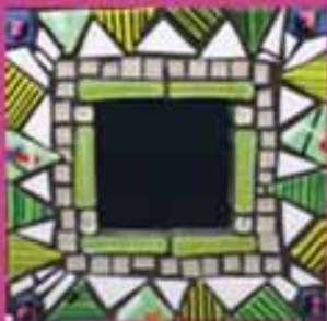
Ginger Kelly, Glass & Mosaics

It's a showcase arts market of ten of the LAA's very talented workshop instructors! The perfect time to learn new skills as they demonstrate their art or craft. Shop, visit with the artists, watch demos and buy local art...all in one spot! Sign up for future workshops or just request more info. Buy a raffle ticket or two! You could be the lucky winner of a $50 Gift Certificate to be used towards the purchase of a future workshop!