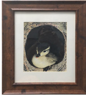
Best Of Show: Bruci Gauthier - My Turn To Jump