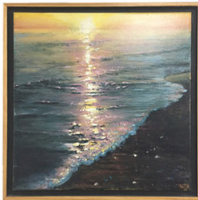
2nd Place: Harold Letz - Sparkle Beach